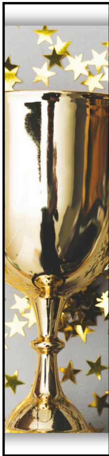
Champions @ Loyola