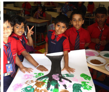
World Art Day