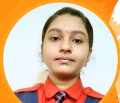
Saaketa Vulasala 93.4%