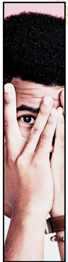
Peek into the Future