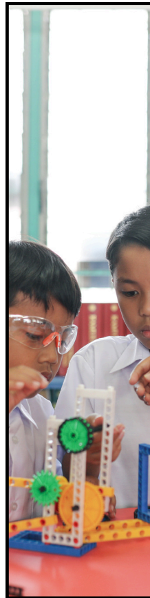
Glimpse of Activities